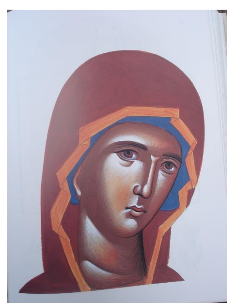
Adding a third light, and so on...