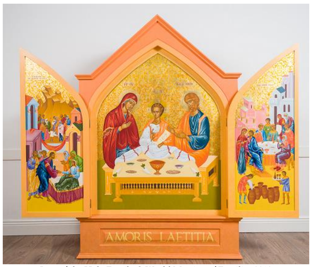
Icon of the Holy Family