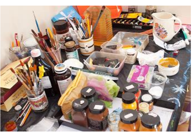
Page | 2