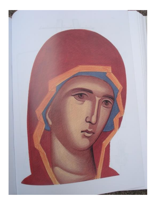
The adding of First Light.