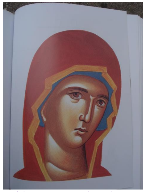
Adding a Second Light.